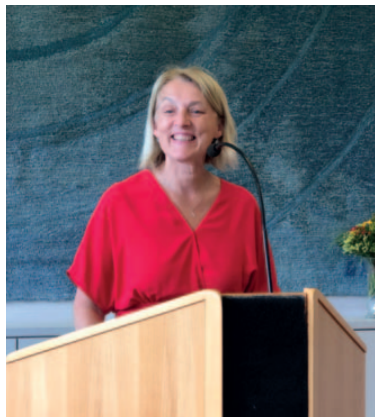
Evelyn Regner ( Vice-President of the European Parliament )