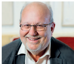
K. Vocelka

Requirements: Attendance and participation in class discussion constitute 30%, a short paper 30% and a written final (essay-type) 40% of the grade.